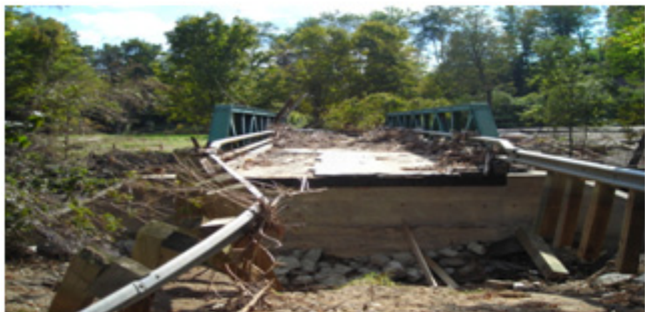
Major road damage in Roxbury, VT

Vermont Emergency Management (VEM) is now accepting HMGP applications from towns and agencies in all Vermont counties in connection with the most recent disaster. The HMGP program is funded through the Federal Emergency Management Agency (FEMA) and is administered by Vermont Emergency Management. Federal funds are available to cover up to 75% of project costs, but there is a 25% local match requirement that is the responsibility of the applicant community.