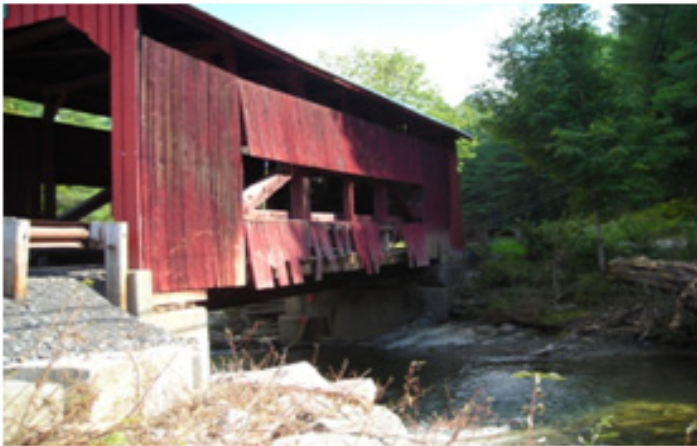
Damaged covered bridge, Northfield, VT

As for town highways, the policy decisions are even greater and the choices more difficult. In areas where roadways along rivers were badly damaged or even destroyed, towns may need to choose whether and where to rebuild. Redundant roadways, or those that serve one or two properties, may not make sense in the future. Communities must also reassess their land use patterns and ask such questions as: How close to the water is too close to build? What kind of businesses or maintenance practices will be allowed where?