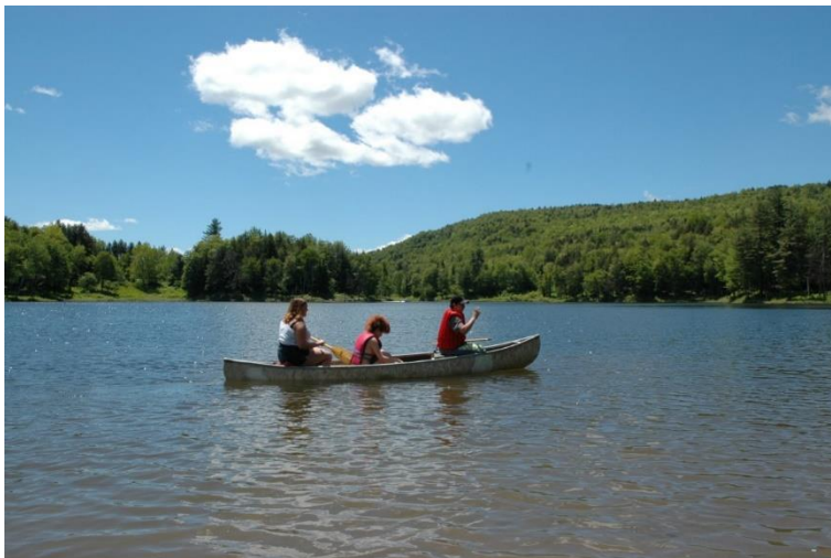
Canoeing on Wrightsville Reservoir, Middlesex, Vermont.

Floodplains are areas of land adjacent to a water body that are frequently inundated by water. While these places serve important ecological functions, including flood-water storage, sediment trapping, nutrient filtering and aquifer recharge, they also can be hazardous to human life and property. Arising from a variety of causes, including heavy rain,