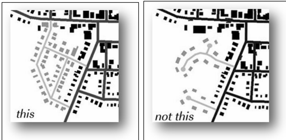
Figure 1: Connected Streets. The diagrams above illustrate two different traffic patterns created by new development (shown in light gray). The diagram on the left highlights several smart growth principles by integrating the new roads with the existing road and providing for a mixture of uses at a density consistent with compact development (Smart Growth Vermont).