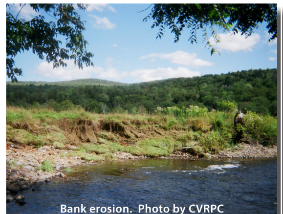
Bank erosion.

Central Vermont Regional Planning Commission and its consultant, Bear Creek Environmental, have started work on the collection of geomorphic data along 3.5 miles of the Great Brook in Plainfield, VT. The data collection will include walking along and in the brook channel cataloging the various features that we see (bars, flood chutes, woody debris, etc), along with making measurements of the channel width and depth.