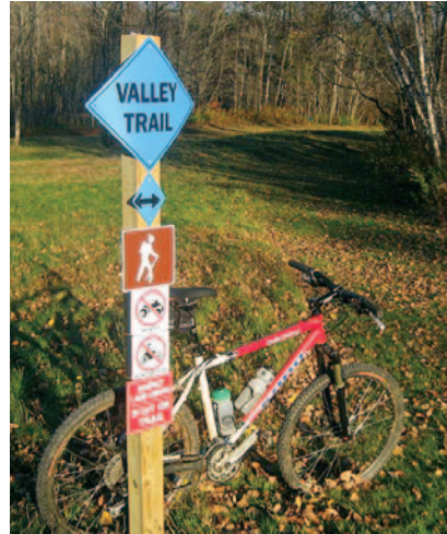
The Valley Trail, part of the Windham Region Trails Project

RPCs often engage in special projects that address unique community needs in many different areas such as flood resiliency, economic development, and transportation.