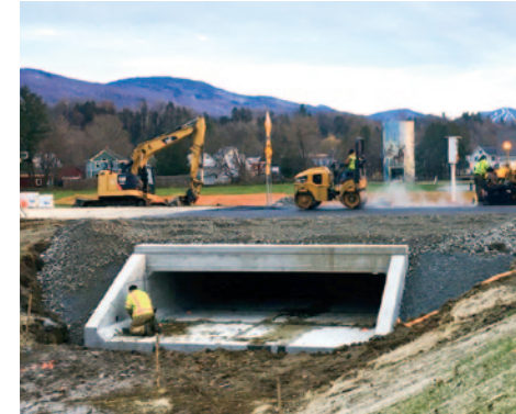
A large flood bypass culvert being installed under Route 15 in Jeffersonville, VT

RPCs assisted with emergency planning in 257 municipalities.