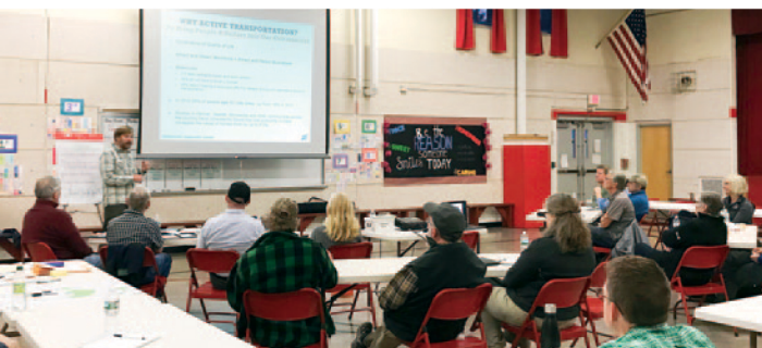
A public meeting about the economics of outdoor recreation in the towns that surround Mount Ascutney

RPCs coordinate planning at the regional level through the adoption and implementation of a comprehensive regional plan and related studies. These plans form a single vision and guide local planning and investment decisions of the public and private sectors.