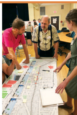
A public workshop for a transportation study

Each regional TAC prioritizes projects, identifies local and regional transportation needs, and provides the platform for public involvement in the planning and development of the state's transportation system. RPCs serve as the point of delivery for