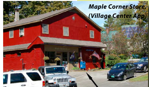
Maple Corner Store, (Village Center App)

To strengthen the linkage between community revitalization and municipal planning,