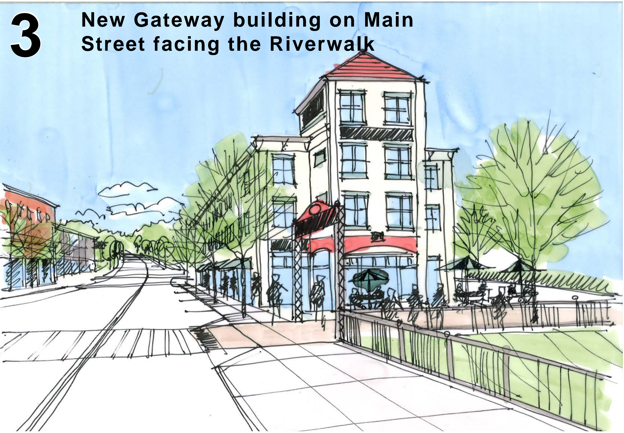
3 New Gateway building on Main Street facing the Riverwalk