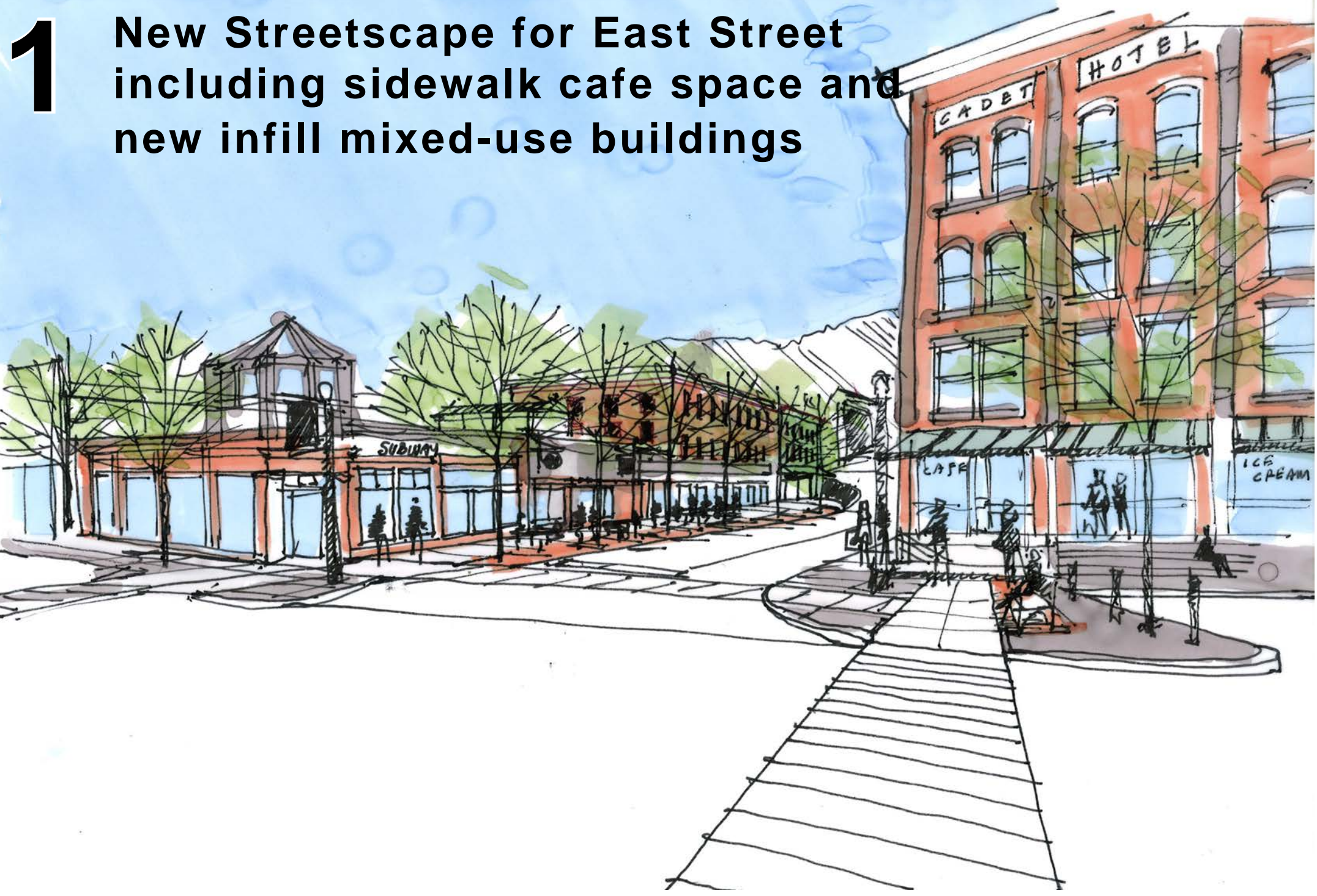
1 New Streetscape for East Street including sidewalk cafe space and new infill mixed-use buildings