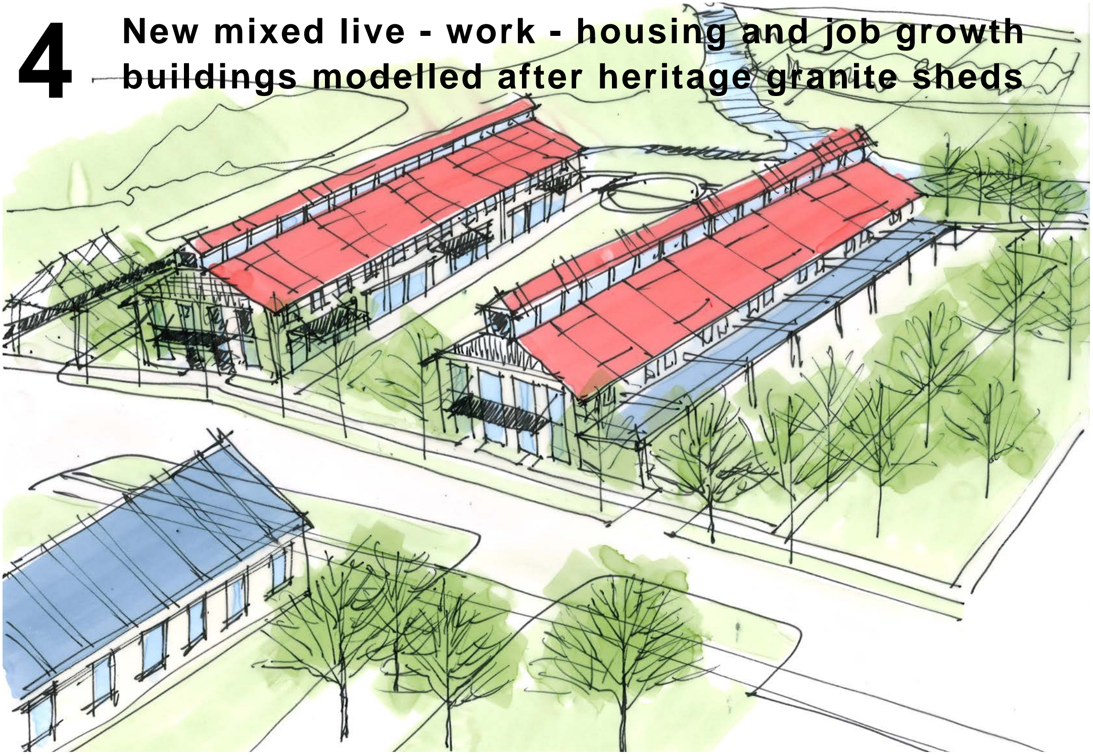
4 New mixed live - work - housing and job growth buildings modelled after heritage granite sheds